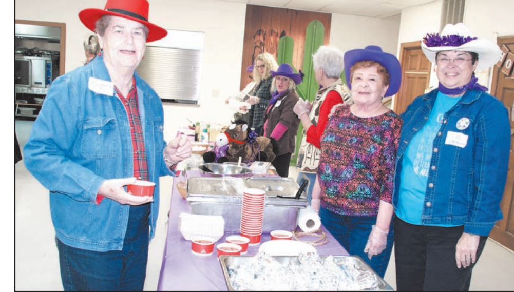
Relay For Life of Union County held their annual kickoff meeting on Thursday, Jan. 25, 2018.

Last year's fundraising teams were given certificates See Relay, Page 2A